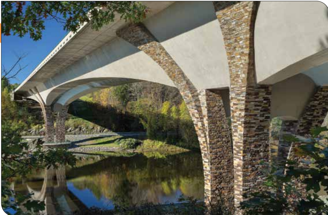
I-91 Brattleboro Bridge, Vermont, USA

ACI’s Excellence in Concrete Construction Awards honor concrete innovation and excellence across the globe.