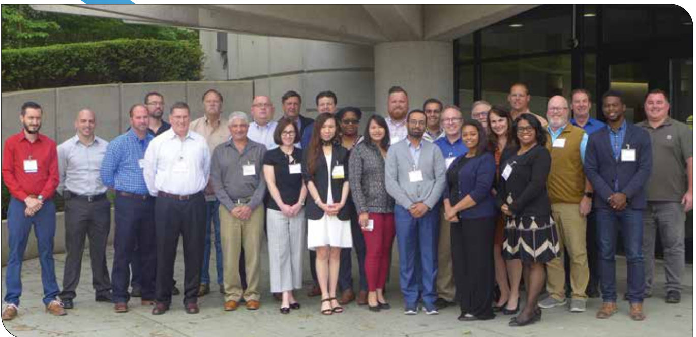
Chapter Leadership Program attendees, May 2019.